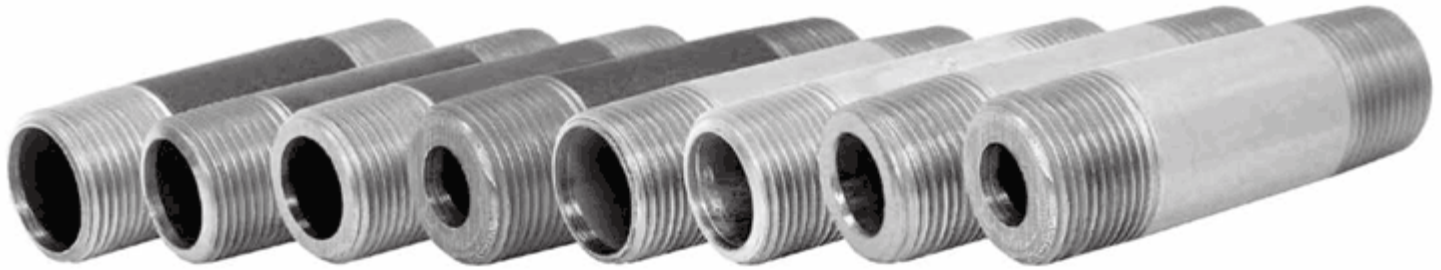
FIG. 320: Standard Black Sch. 40 FIG. 325: Extra Heavy Black Sch. 80 FIG. 326: 160 Black Sch. 160 FIG. 327: XXH Black FIG. 330: Standard Galv. Sch. 40 FIG. 335: Extra Heavy Galv. Sch. 80 FIG. 333: 160 Galv. Sch. 160 FIG. 329: XXH Galvanized