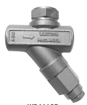
WD600SB Strainer & Blowdown Valve