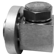
WD600LSM-HP HIGH PRESSURE Thermodynamic Steam Trap Module (Side Mount Style)