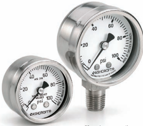
50 mm lower connection